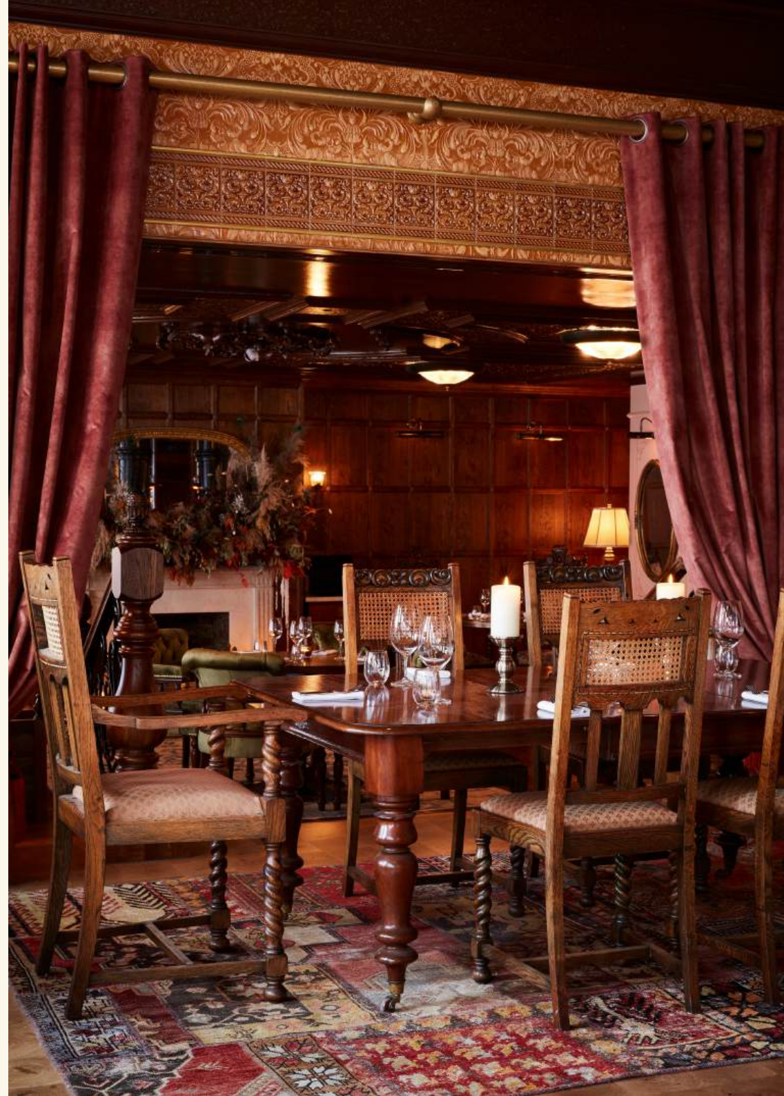
TABLE SERVICE WIFI AVAILABLE