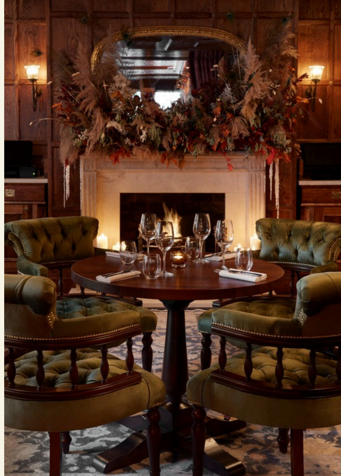
TABLE SERVICE WIFI AVAILABLE PRIVATE ROOM