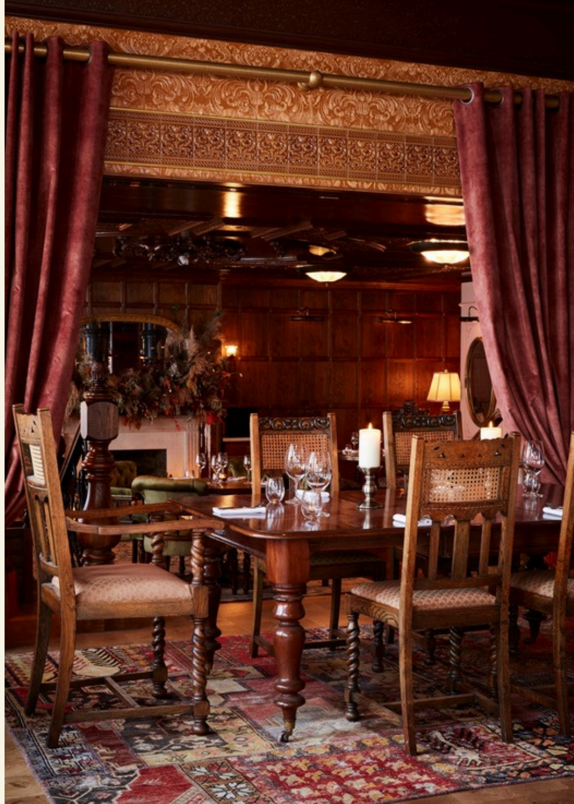
TABLE SERVICE WIFI AVAILABLE