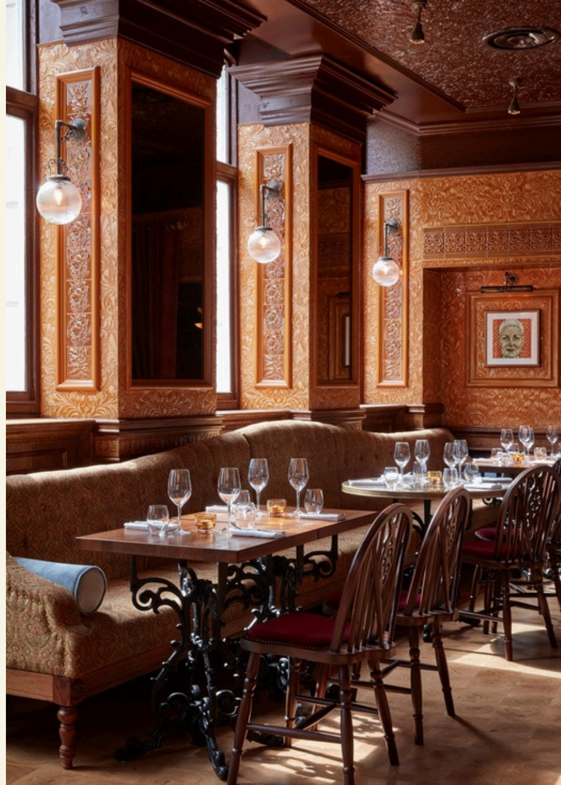
TABLE SERVICE WIFI AVAILABLE